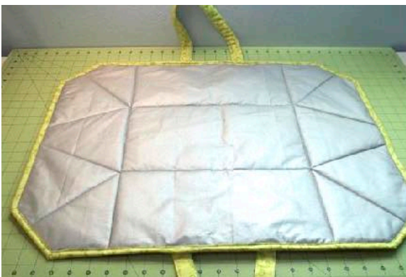
Finished Iron Caddy Tote Unfolded