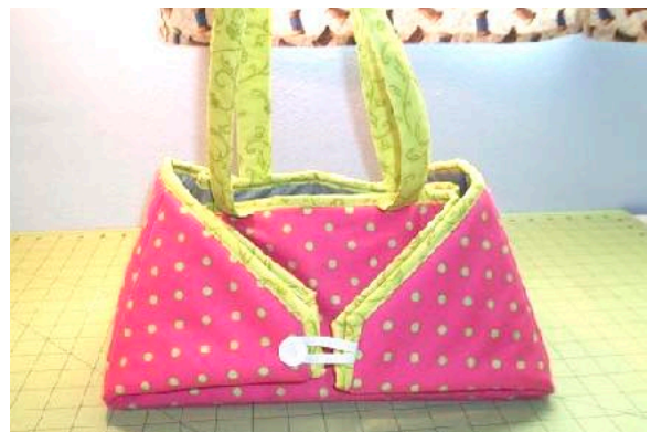
Finished Iron Caddy Tote Folded